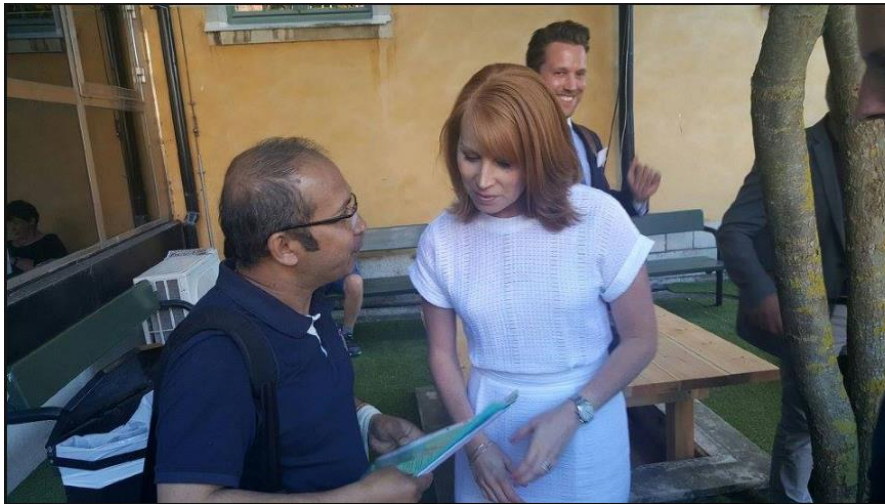
Annie Lööf, Swedish Centre Party