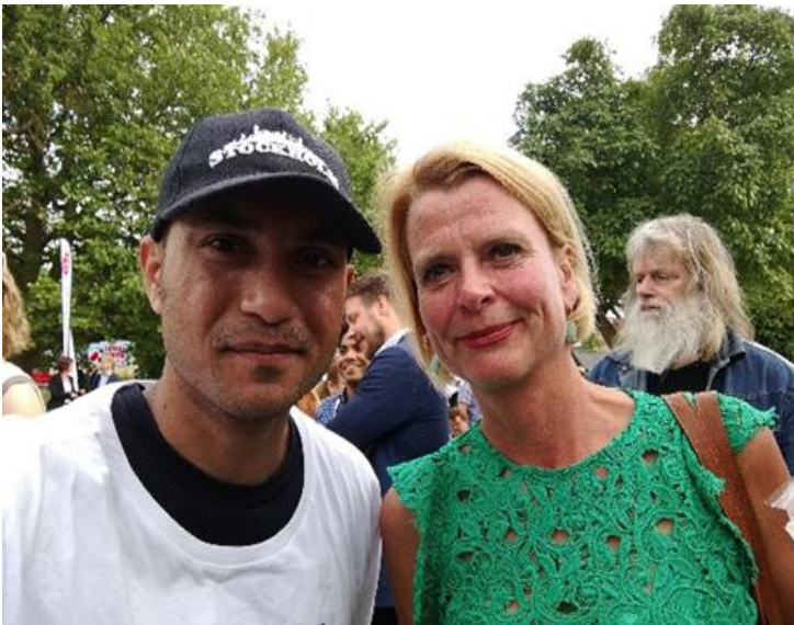
Åsa Regnér, Swedish Social Democratic Party